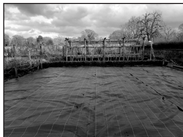
Using Mypex to suppress weeds (Dec 20)