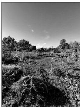
Starting the clearance (Oct 2020)

this had ever happened before. Nature took over very quickly during the warm, dry spring and summer, and the garden became an undisturbed haven for a wide variety of birds and insects who suddenly had the whole place to themselves.