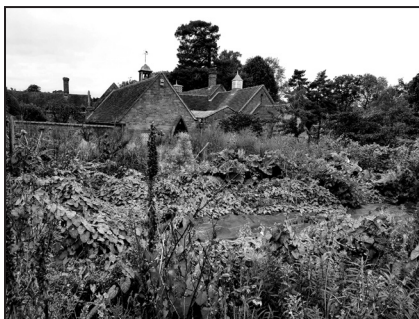
Nature takes over (Sept 20)

Our café is now able to take full advantage of all our homegrown produce, and seeing it thrive once again has made all that hard work so worthwhile.